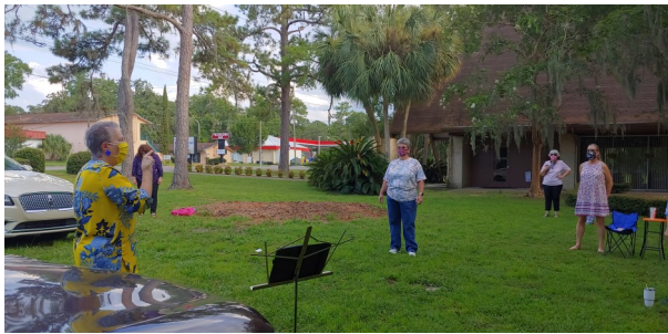
Gainesville Harmony Show Chorus rehearsing outside Grace Presbyterian Church

Once a month, we have also held a social distancing rehearsal in the parking lot of Grace Presbyterian Church where we usually rehearse. While it isn't typical, we enjoy being able to hear our chords ring!